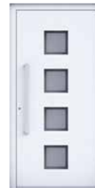
AP08 page 17