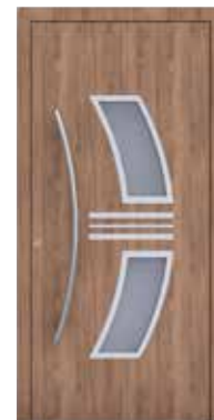
AP15 page 19