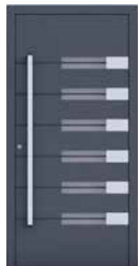
AP18 page 16