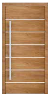
AP04 page 20