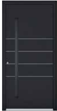
AP21 page 10