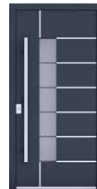
AP02 page 15