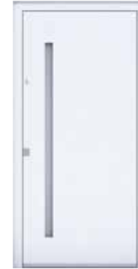
AP24 page 11