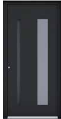
AP22 page 10