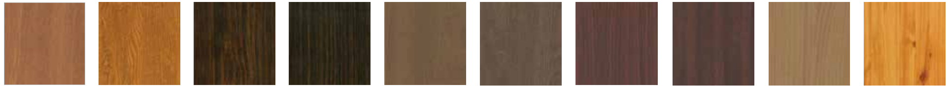
Golden Oak ADEC D101