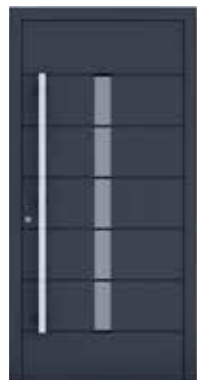
AP16 page 16