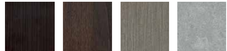
Palisander ADEC M332