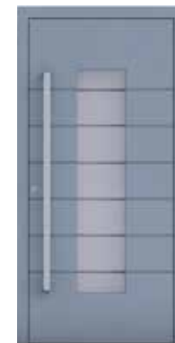
AP31 page 16