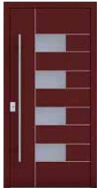
AP26 page 12