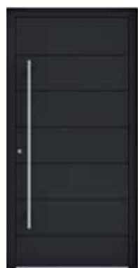
AP05 page 20