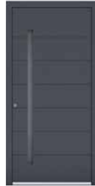
AP23 page 11