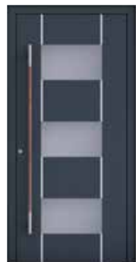
AP13 page 18