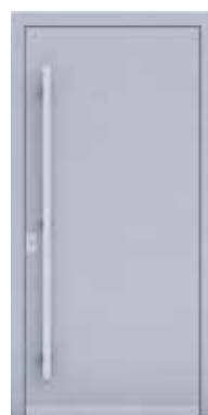
AP10 page 20