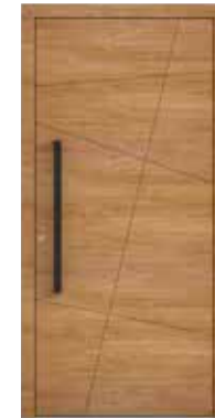
AP29 page 14