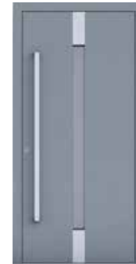
AP11 page 13