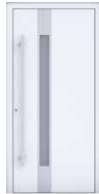
AP28 page 13