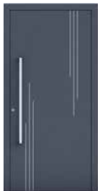
AP30 page 14