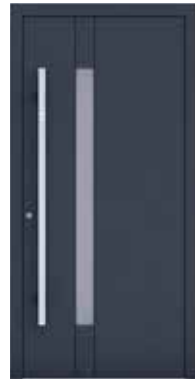
AP27 page 13