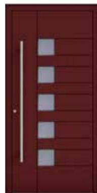
AP07 page 17