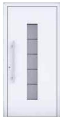
AP19 page 14