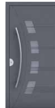
AP17 page 19