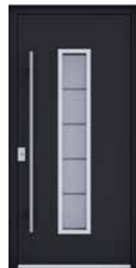
AP01 page 15