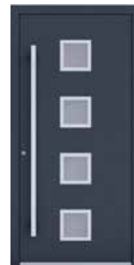
AP03 page 17