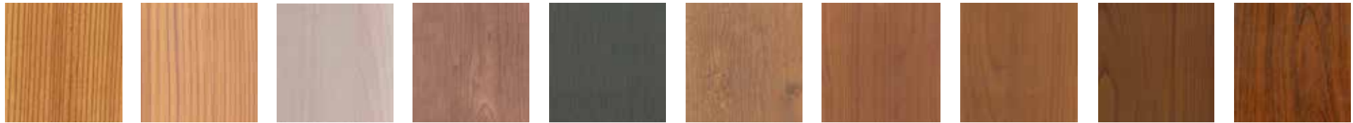
Fir ADEC J107