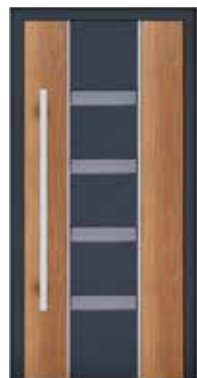
AP09 page 18