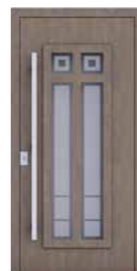
AP20 page 21